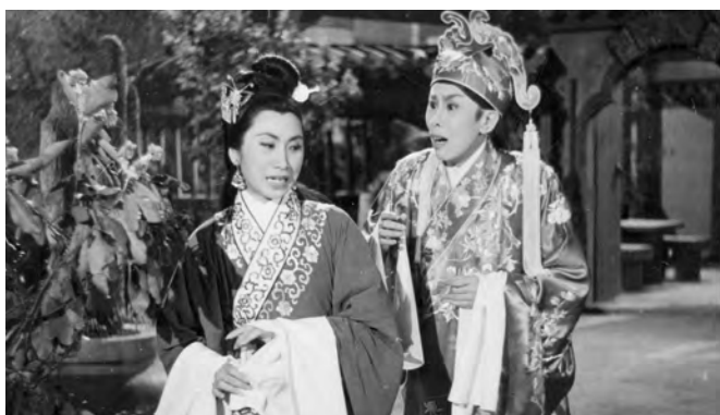
才子佳人：汝洲愛得癡狂，卻不知眼前玉人正是意中人。 Gifted scholar and beauty: Yu-chau loves insanely with his whole being, not knowing that the lady he sees in front of him is his dream lover.