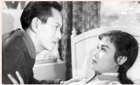
《刀下美人魂》(1959): 與張瑛合演一對璧人。 Beauty Slain by the Sword (1959): With Cheung Ying, the two make a handsome couple.