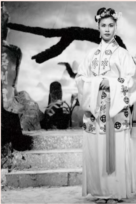
《風流天子》(1953): 一人分飾嫦娥和楊玉環, 天姿國色。 Playboy Emperor (1953): Her surpassing beauty is intoxicating.