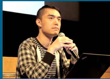
曾肇弘 Eric Tsang Siu-wang