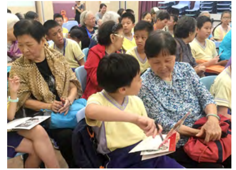
跨代交流，樂也融融。 Communication is the key to intergenerational harmony.

for the post-screening discussions. Unlike regular discussions, I asked the students questions that centred on specific aspects of the film related to everyday life. For example, children today accustomed to the care of domestic helpers from overseas would find the 'Ma-je' (Chinese spinster nanny) in the film quite strange. They also never imagined a 40-dollar meal back then would be considered an extravagance that would require a loan from a pawnshop. As for the conflicts between the parents in the film, such as the question of whether children should be required to do house chores and receive corporal punishment when they make mistakes, they all provided interesting topics for discussion. The students' response to my questions was overwhelming; they all raised their