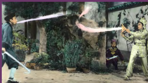
《七劍十三俠》(1967): 與石堅大打出手。 Seven Knights and Thirteen Chivalrous Men (1967): A one-on-one fight scene with Shek Kin.