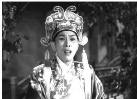
修復前後 Before and after the restoration

and recording the number of frames in each shot. After working for more than two months, they located all the frames missing in dozens of shots in the main B&W copy. Luckily, most of these frames could be found in the other two copies and could be used to make up for what was lacking, thus enabling the images and actions to become more smooth and natural.