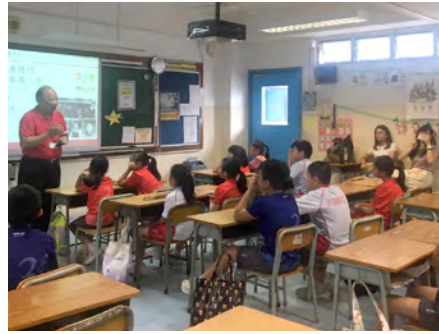
義務工作發展局派員教導學生如何跟長者溝通。 Instructors from Agency for Volunteer Service taught students how to communicate with the seniors.

As of writing, I have already visited two of the schools, serving as docent