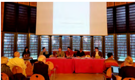
執行委員會成員主持會員大會 The Executive Council hosted the General Assembly.