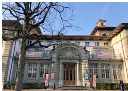
FIAF 周年大會會場 The venue of the 75th FIAF Annual Congress and Symposium

「修復」後重新發行，一般是從商業價值的角度出發，務求把影片「去舊」，變成儼如全新製作的電影去吸引新一代觀眾。資料館「修復」電影則以「還原」為目的，著重保持影片原貌，只處理菲林經歲月洗禮後產生的變化和留下的痕跡，而不作任何改動和美化。兩者的目的和標準自然截然不同。