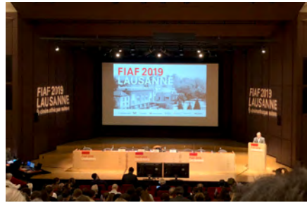
研討會探索「電影資料館的過去到未來」 This year's symposium explored the theme 'From the Past to the Future of Film Archives'

At one of the sessions of the Technical Commission, participants discussed a collaboration between Britain's Imperial War Museums and Peter Jackson, acclaimed director of the Lord of the Rings trilogy, to restore B&W WWI documentaries. Jackson colourised the footage, added special and sound effects, and even hired lip-reading experts to interpret dialogues between soldiers, thereby adding a completely new soundtrack to what might have been originally silent footage. The final product, They Shall Not Grow Old (2018), did exceptionally well at the box office and was one of the most discussed and critically-acclaimed films. Yet, given Jackson's creative deliberations, it is perhaps more accurate to say that They Shall Not Grow Old is a 'makeover' rather than a restoration.