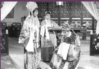
卿姐拍《大紅袍》(1965)時人急智生 Sis Hing demonstrated quick wits in a time of crisis when shooting The Great Red Robe (1965).