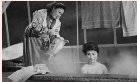
《璇宮艷史》(1957): 當年的大膽演出。 My Kingdom for a Husband (1957): The actress put up a bold performance.