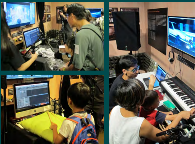
齊來做擬音師 Let's be a foley artist

Cheung added that sounds of swordplay in wuxia films could be generated by fencing with steel rulers while the demonstrators used computer software to tune pre-recorded engine sounds and stage a thrilling car race. Participants were all amazed by the imagination and creativity of foley artists, and everyone had the chance to apply what they had learned immediately and be a foley artist. Kids and grown-ups alike all enjoyed it and had so much fun. [Translated by Hayli Chwang]