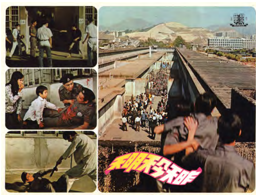
Patrick Lung Kong's Yesterday, Today, Tomorrow (1971) denotes the Hong Kong 1967 Riots. A large part of the film had to be edited before it was given the permission for release.

standards of local films. In particular, advancements in areas such as character design, location shooting, synchronous audio recording, and music production accelerated the modernisation of Hong Kong cinema.