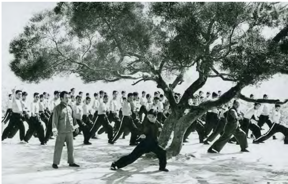
Directed by Wong Fung, Super Boxer (1971) was the last publicly released Cantonese film before the disappearance of the genre in the early 1970s.

Juxtaposing these Cantonese detective flicks with any local cop film from the 1980s and 90s—such as Danny Lee’s Law with Two Phases (1984), Jackie Chan’s Police Story (1985), or Sun Chung’s City War (1988)—even the least attentive viewer would notice the obvious differences in terms of dramatic formula, character design and aesthetic judgement. The detective film, as it turned out, didn’t blossom into a distinct genre; it was the 1970s crime films and TV dramas that provided the template for the cop film to evolve into a major genre in Hong Kong cinema. This essay sets out to trace how this film genre came into being, with special focus on a pioneering work of the genre: Jumping Ash (1976).