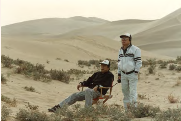
Hsia Tsu-hui worked with Li Han-hsiang seamlessly.

In around 1978, his health began to show problems with constant chest pain. One day he was suddenly hospitalised. The doctor said three of his four blood vessels were blocked. The only solution was to undergo surgery in the US. He flew there and Lisa Lu referred him to a doctor who eventually cured him. I found out later that before this trip, he had surreptitiously slipped off to the Mainland to visit his old friends in Beijing. He was afraid that he would die without seeing his childhood home. But his contract with Shaw Brothers meant that if he did it openly, his films would not be able to enter the Taiwan market, and it would be a great loss for Shaws. After his recovery in the US, he had established contact with the the Mainland. It was around this time that he got tired of shooting erotica. Subsequently he went to the Mainland to make The Burning of the Imperial Palace (1983) and Reign Behind a Curtain (1983). My Taiwanese nationality prevented me from following suit and so I returned to Taiwan to make TV dramas.