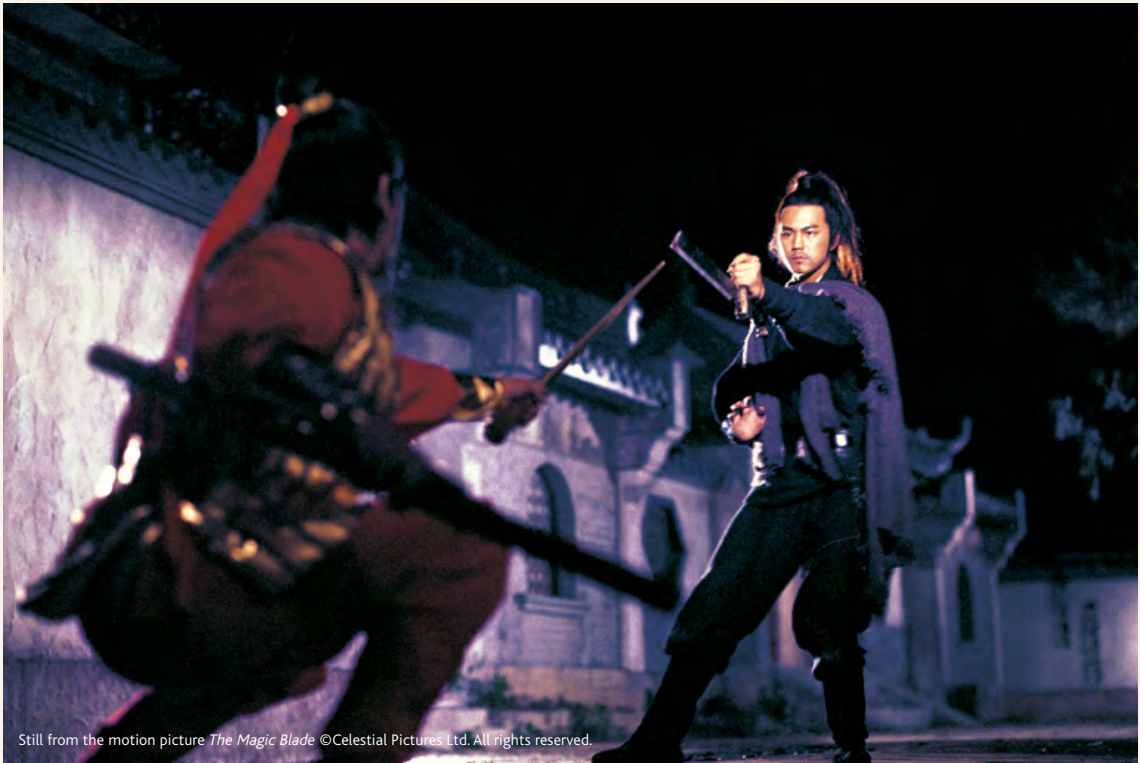
Still from the motion picture The Magic Blade

Ti Lung had starred in a number of Gu Long films directed by Chor Yuen. The Magic Blade (1976) is the first one of them.