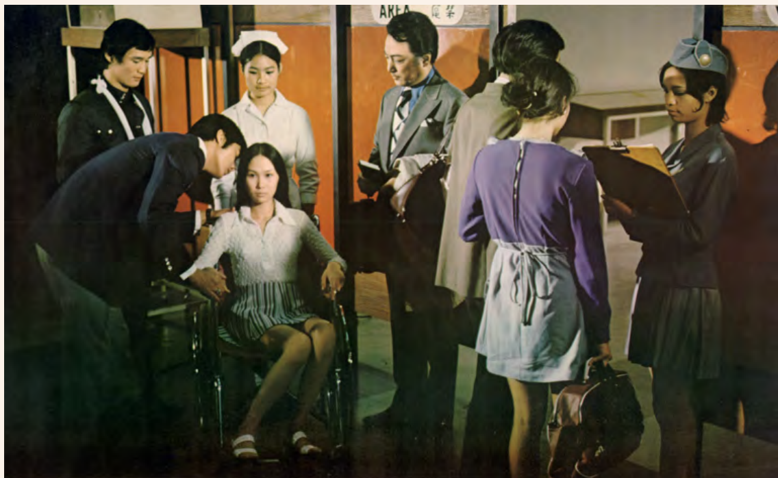
Love and Blood (1972)

day and ended our theatrical runs on the same day. (Note: Sexy was released on 16 March 1973; Adventure was released on 28 June). Our film was distributed through the Golden Harvest cinema circuit, while their version went out through the Shaw Brothers cinema circuit. We won by a nose; their box office receipts hit HK$1.1 million while ours hit HK$1.19 million. When Shaws saw that I had won, they were very pragmatic; they recruited me to work for them as a director. I later directed Girl with Long Hair for them.