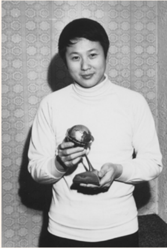
Ho Fan won the Best Film Award at the Banbury International Film Festival in the UK, with his seminal work— Gulf (1966).