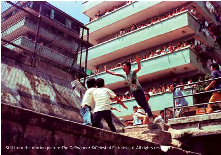
Still from the motion picture The Delinquent

Chang Cheh's modern and masculine Hong Kong action film— The Delinquent (1973).