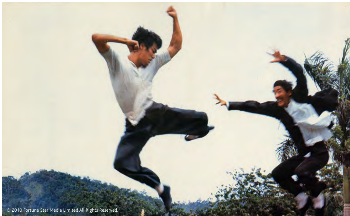
When The Big Boss was filmed in 1971, Bruce Lee had just returned from the US. Though not yet a legend, a ready and eager Lee was on the verge of breakthrough.

Chinese and Western, North and South in the post-WWII era. The golden 1980s would not have materialised if not for that.