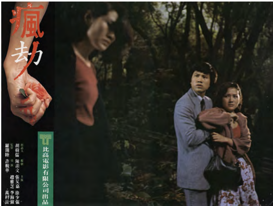
Ann Hui's The Secret (1979) is one of the representative works of Hong Kong New Wave.

rather than enriching their characters and plot narratives, making it difficult to lure audiences back into the cinema. This was mainly caused by a stale pool of talent in the industry.