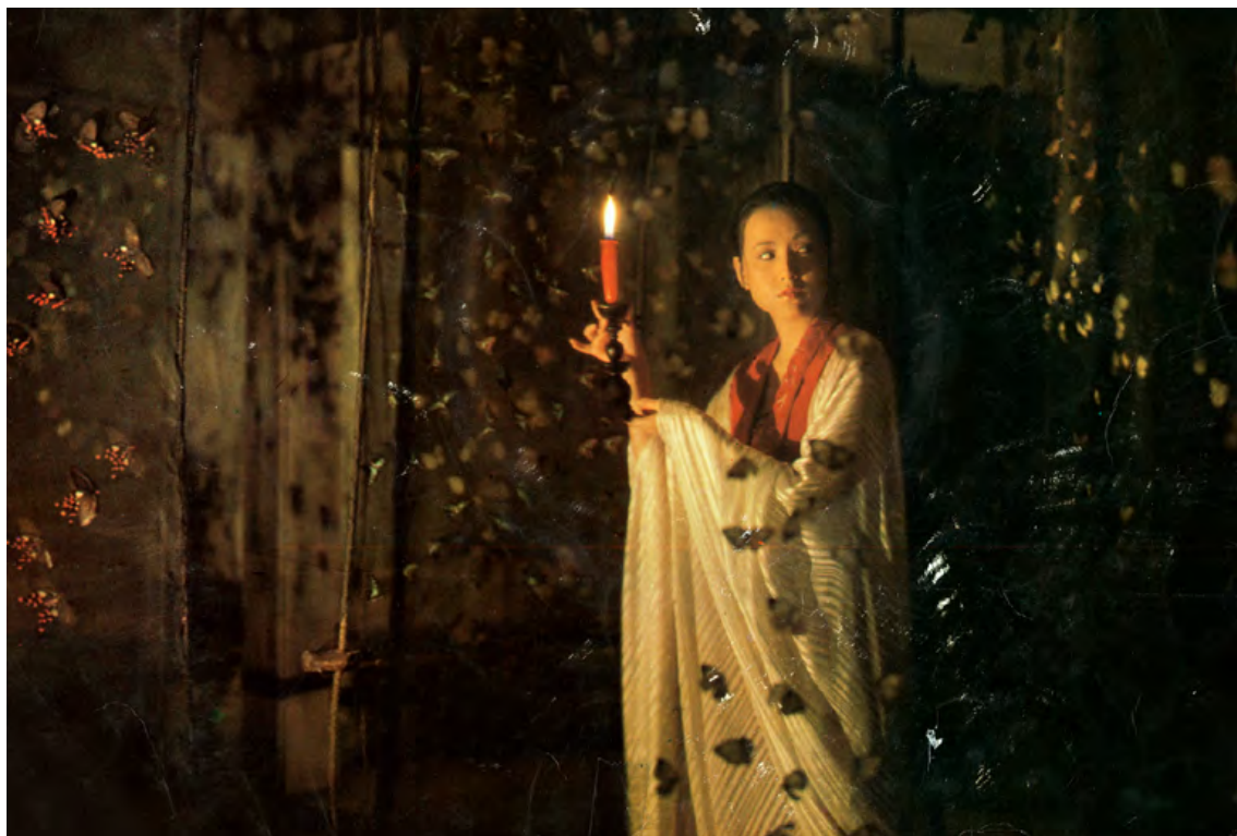
Tsui Hark completed his first film The Butterfly Murders (1979) with the support of Ng See-yuen.

action films. Dead End (1969), The Delinquent (co-directed with Kuei Chih-hung, 1973), and The Generation Gap (1973), for example, reflected the rebelliousness of the new generation. There were also films that offered realistic depictions of Hong Kong's sex industry, featuring taxi dancers, prostitutes, bargirls, and even foreign soft-core adult film actresses (such as Virgins of the Seven Seas [1974]).