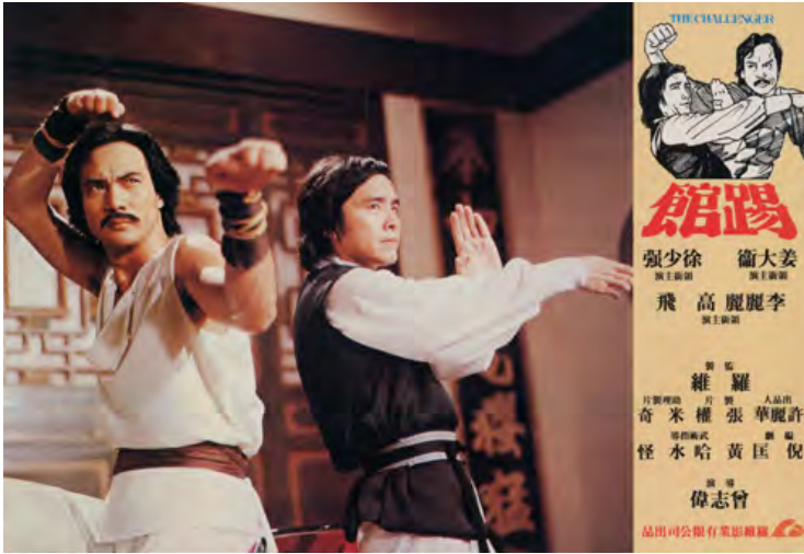
The Challenger (1979), a kung fu film directed by Eric Tsang.

heroes from Guangdong, including Five Shaolin Masters (1974) (about the ‘mythology’ surrounding the founding of the Society of the Heaven and the Earth). To a certain extent, these works paved the way for the success of gangster films that would come later. These films even featured triad rituals that were banned in the past.