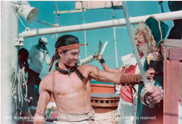
The Pirate (1973) comprised of a number of explosion and thrilling action scenes, with alarmingly dangerous situations during filming.

For instance, there was one battle scene in The Pirate (1973) that took place in international waters. We had to hurl self-made explosives into the water. The enemy's ship would fire and we would detonate the explosives to simulate cannon fire from the enemy. What we hadn't foreseen was that the current would quickly sweep the explosives to the bottom of our ship. If we had pressed the button, we would all be dead, because there were tons of similar explosives in our cabin. In another scene, I had to grab the sail and suavely swing myself over to another vessel. The wind was much stronger than I expected, so I was rolled up by the sail and thrown overboard. I was lucky enough to have landed on the side of the deck. If I had fallen on one of those thick steel cables, I would have suffered serious injuries. This was how we were learning on the job.