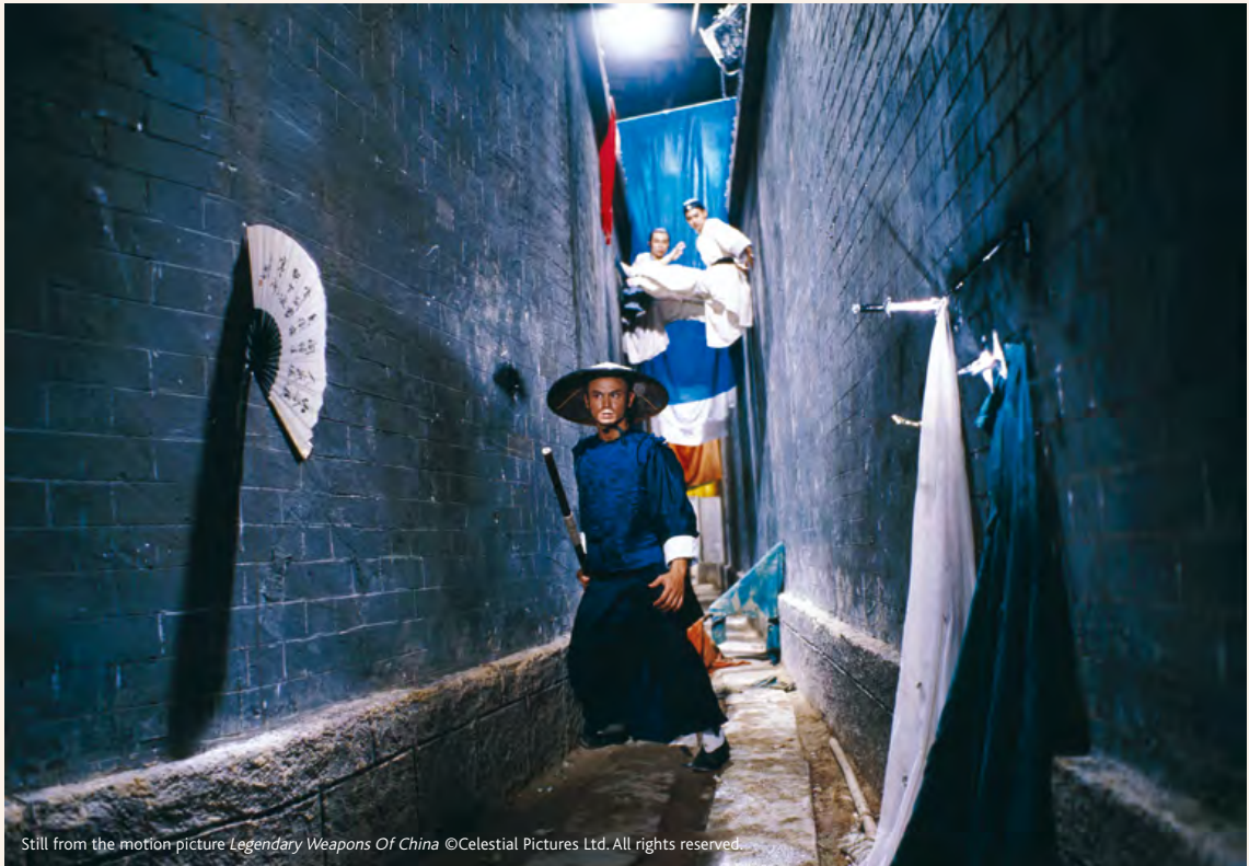
Still from the motion picture Legendary Weapons Of China

The alleyway battle designed by Lau Kar-leung in Legendary Weapons of China (1982) was highly original, which created powerful and dynamic interactions between combatants in a restricted environment.