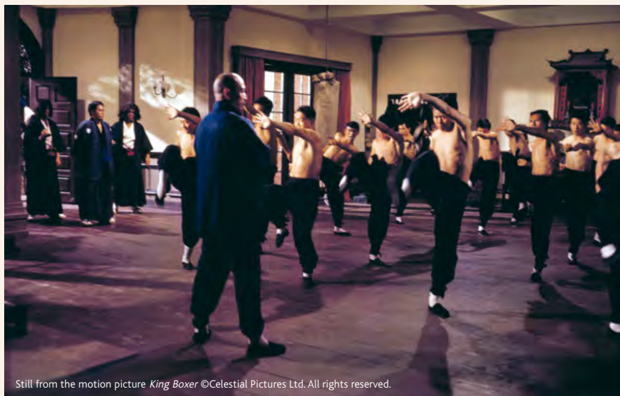
Still from the motion picture King Boxer

Five Fingers of Death (aka King Boxer , 1972) was Lau Kar-wing's breakout film as a martial arts choreographer.