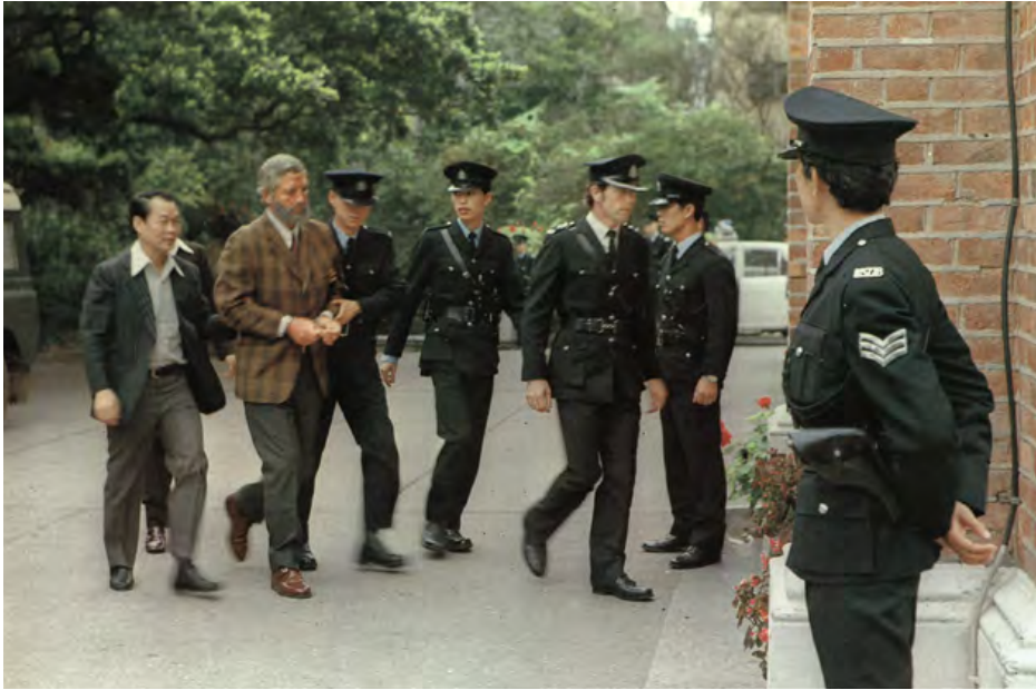
Anti-Corruption (1975) by Ng See-yuen launched the Hong Kong true crime exposé film genre.

ho, better known as Crippled Ho, in November. These sensational tales of crime became cash cow for the tabloids. Weekly magazine The Covered-Ups , for example, saw its sales skyrocketed with its reports on the drug trade in Hong Kong. Similar publications also burst upon the scene. 1