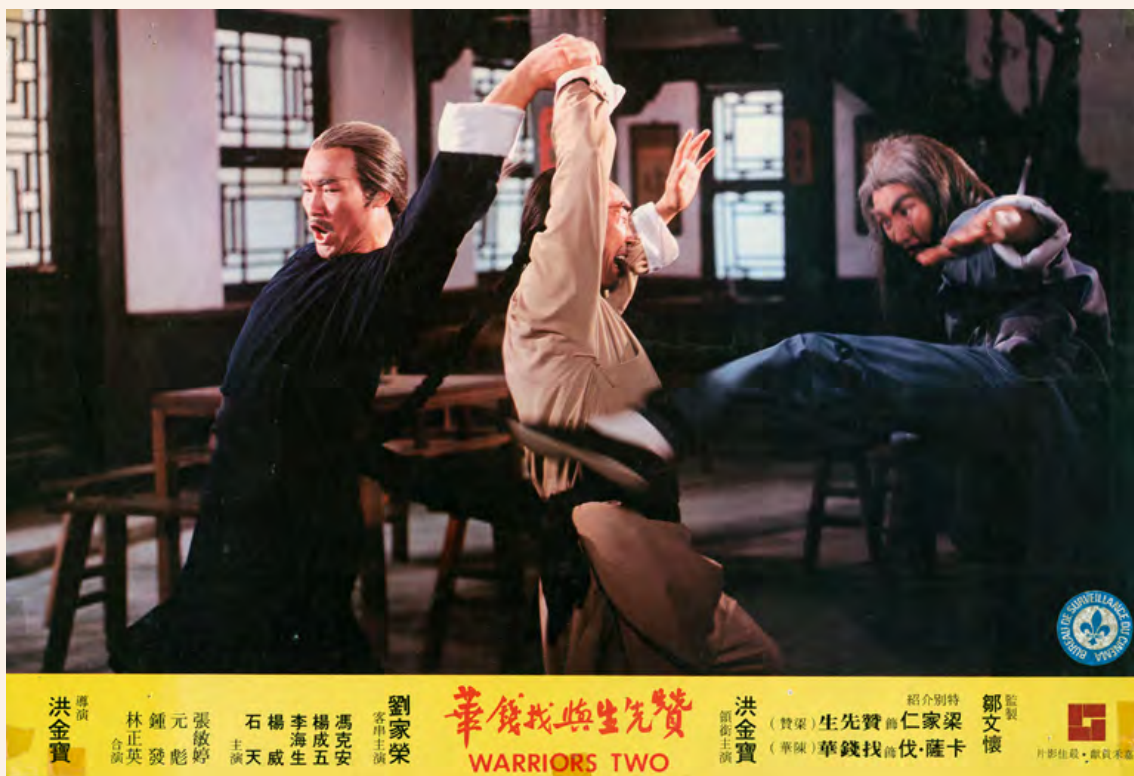
Although at the time most kung fu films featured the Hung Fist, Sammo Hung had specifically studied about Wing Chun to film the box-office hit, Warriors Two (1978).

Wah in this film. I drew inspiration from Wing Chun again one or two productions after this (Note: referring to The Prodigal Son [1981]), because I felt that there was more to it. To be honest, what hadn't the audience seen before? The only thing that matters is to make a film that is entertaining.