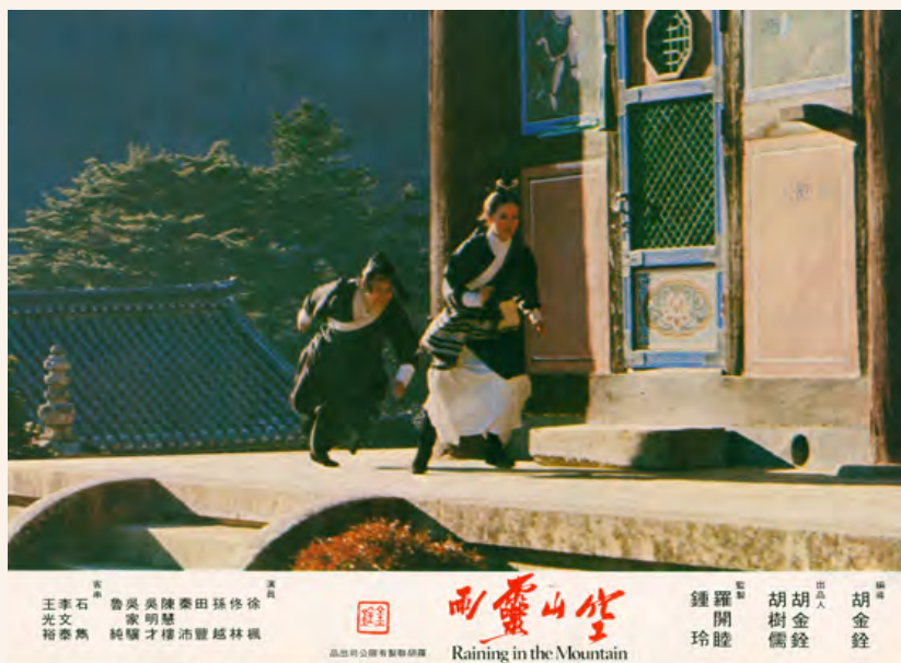
Raining in the Mountain (1979)

scene and we shared our ideas on the use of cinematic language, tone, to designing costumes, lighting and mood. Our meeting went on for a long time. I thought, even if I didn't land the job as his cinematographer, it was already wonderful to get to know such a remarkable director. When Hu rang me up and offered me the job, I was so excited that tears welled up in my eyes.