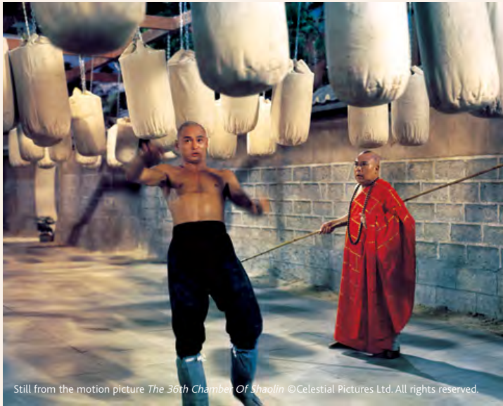
Still from the motion picture The 36th Chamber Of Shaolin

Lau Kar-leung designed quite a lot of training scenes in The 36th Chamber of Shaolin (1978), which proved to be crowd-pleasers.