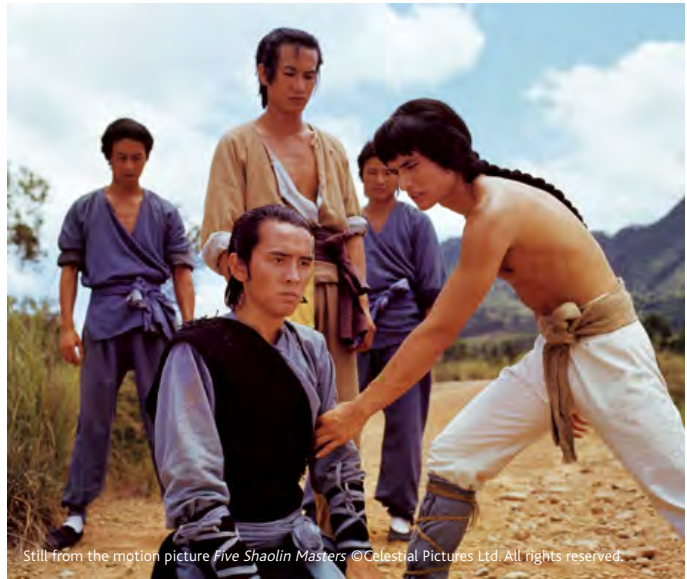
Still from the motion picture Five Shaolin Masters

Five Shaolin Masters (1974) was, to a certain extent, a predecessor to the post-modern gangster hero film genre.