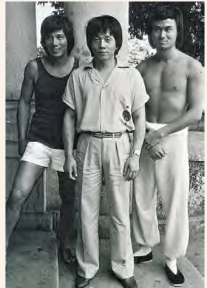
Group photo with Lau Kar-leung (centre) and Gordon Liu Chia-hui (right)

Lau Kar-leung designed quite a lot of training scenes in The 36th Chamber of Shaolin (1978), which proved to be crowd-pleasers.