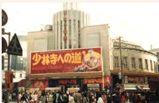
The 18 Bronzemen (1976) was extremely popular, and was screened internationally in Japan, France, Italy, Spain and Germany, etc.