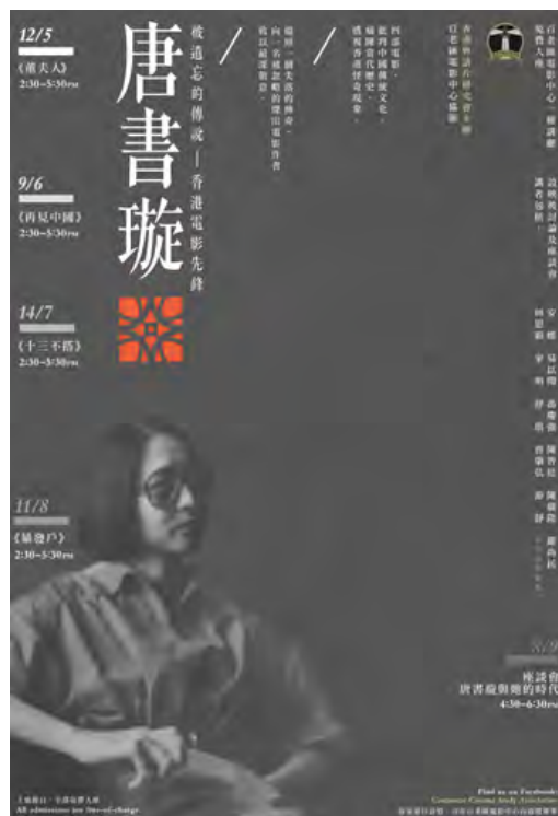
Poster for the 2013 event, A Forgotten Legend: Hong Kong's Pioneer Filmmaker Tong Shu-shuen