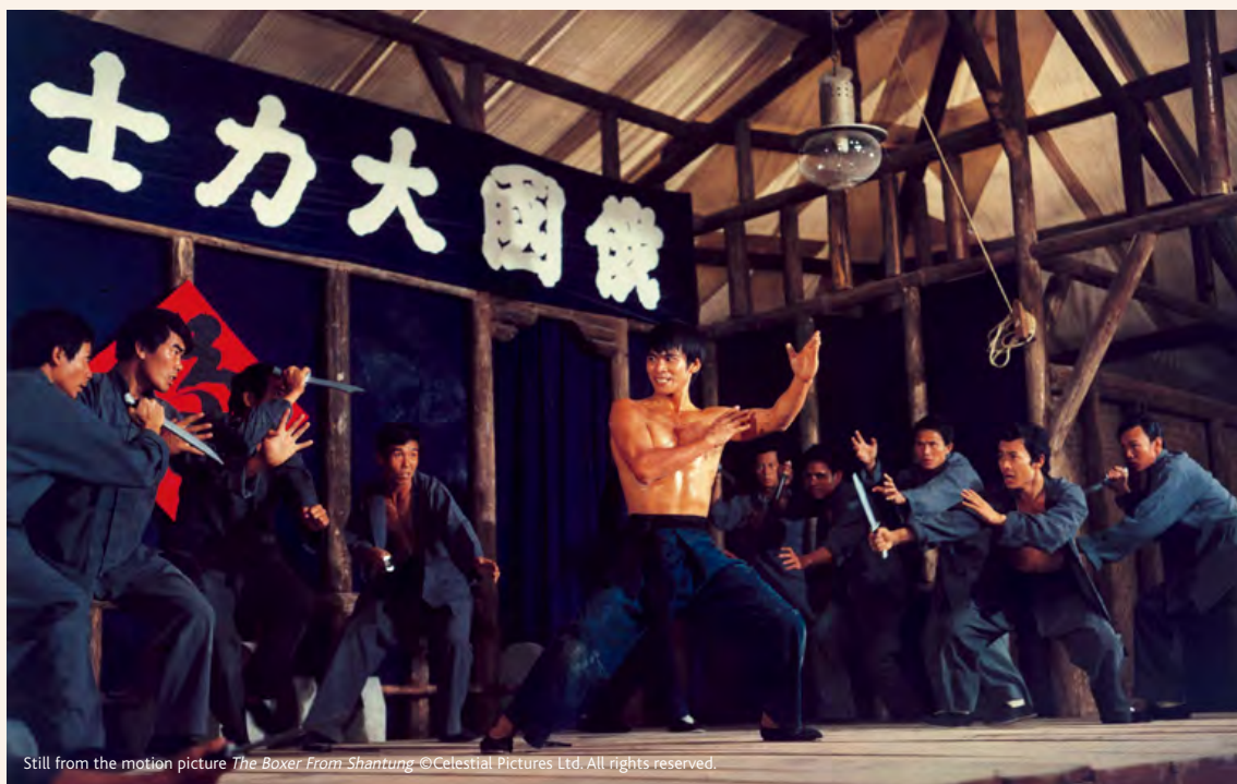
Still from the motion picture The Boxer From Shantung.

Director Chang Cheh, with a keen eye, casted Chan Koon-tai as the lead for Boxer from Shantung (1972).