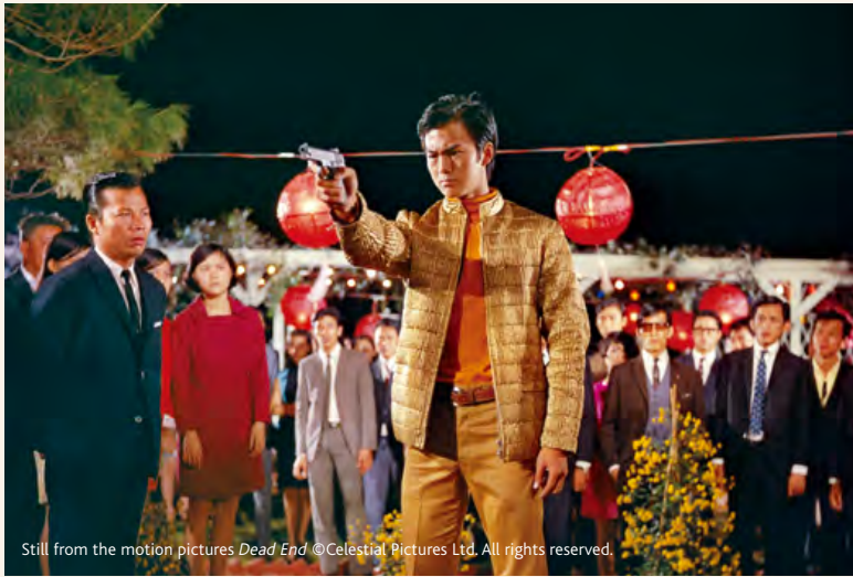
While still a relatively newcomer, Ti Lung had a taste of ‘passing a counterfeit as real’ in Dead End (1969).

When my contract was up, it was renewed for three years, and then another three. That repeated a few times. I went on to make a large number of Qing dynasty films.