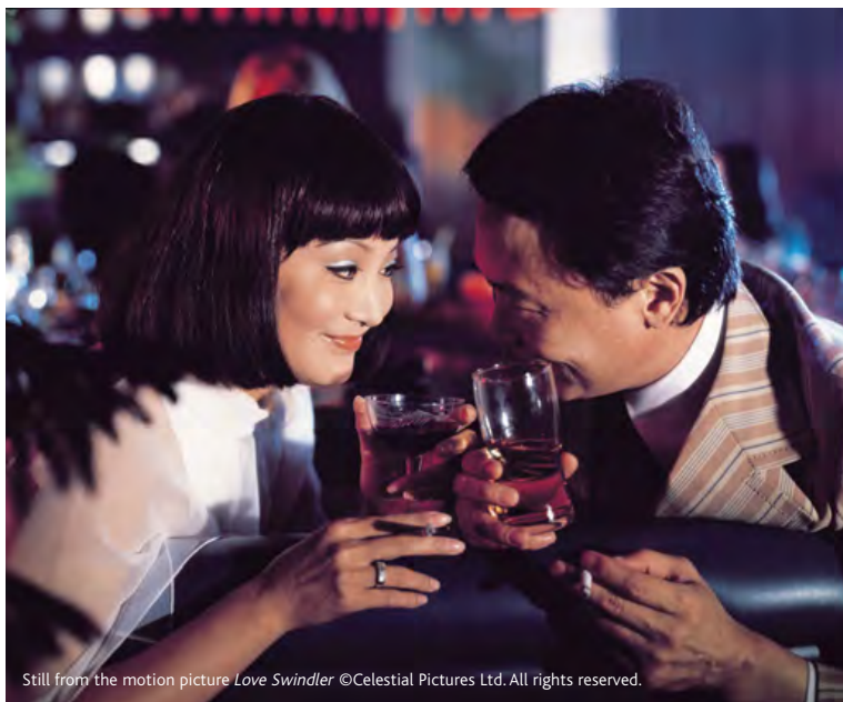
Still from the motion picture Love Swindler

The Legends of Cheating (1971), directed by Li Han-hsiang, unveiled the trend of gambling-fraud cinema. He later made a number of films of the same genre, including Love Swindlers (1976).