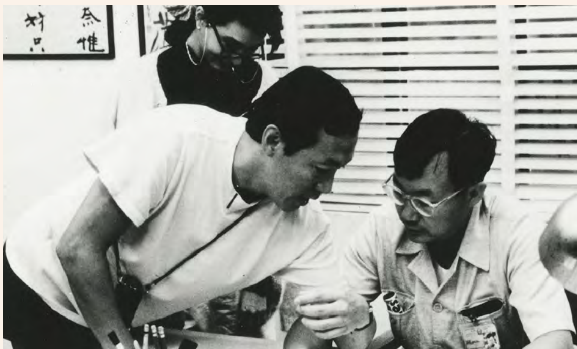
Philip Chan (front left) is a junior to Michael Hui (front right) at La Salle College. Not only were the two long-time collaborators on films, they were close friends for years. This is an on-set photo during the shoot of Mr Boo VIII Chocolate Inspector (1986).