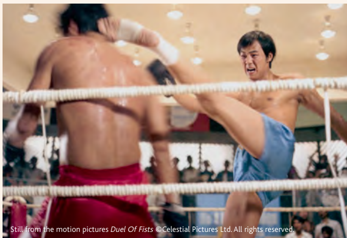
Still from the motion pictures Duel Of Fists

Directed by Chang Cheh, Duel of Fists (1971) introduced Thai boxing in a spectacular demeanour, with the support from a number of martial artists.