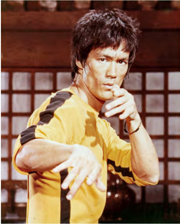
Based on Wing Chun, Bruce Lee's kung fu incorporated boxing skills from various countries, melding into a kind of play of his own, and became Hong Kong legend. Pictured here is from The Game of Death (1978).

in that it exemplified the people's fighting spirit, diligence, diversity, and autonomy. As one of many global 'Cultural Revolutions', it also echoed the anti-establishment and anti-authoritarian movements which erupted in various parts of the world in the 1960s and 70s.