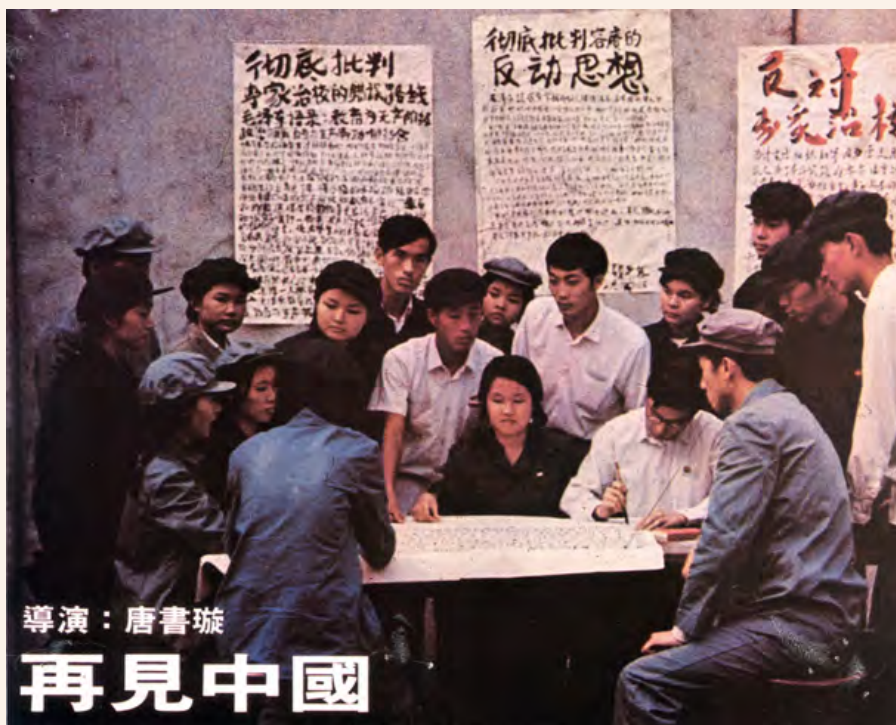
China Behind (completed in 1974 and released in 1987)

were left-leaning politically. While a lot of us were eager to play our part in the development of our motherland, I found it baffling that the local and international media were swamped with news stories of youths risking their lives to flee from the Mainland. Putting together news and insider stories readily available in Hong Kong, such as the policies announced and power struggles among the leadership, with the material I gathered from the interviews with a few dozens of Mainland refugees who survived their flight to Hong Kong, I had the basis for my story of China Behind .