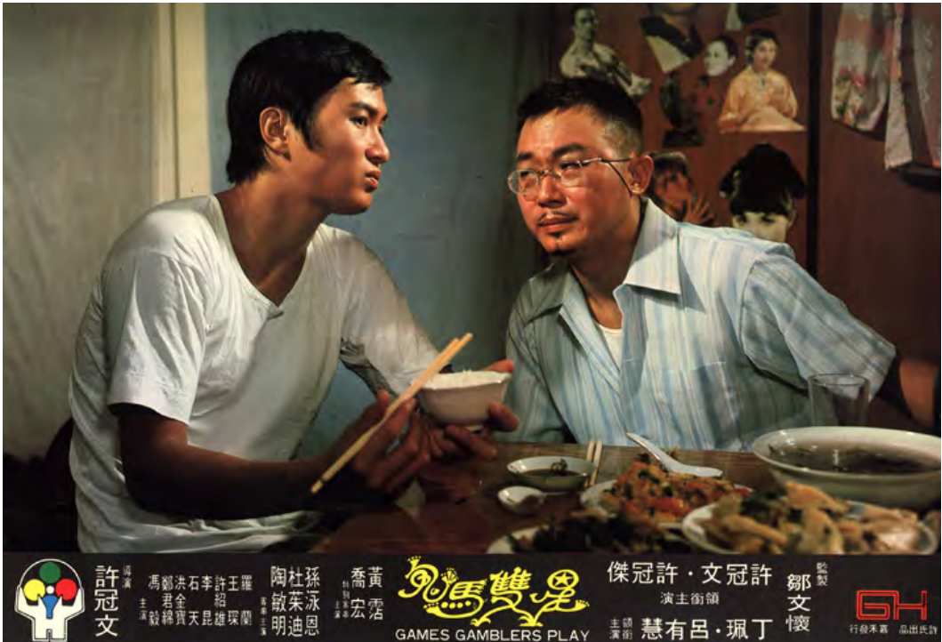
Inspired by television shows, Games Gamblers Play (1974) was a hit at the box office. It is an example of TV influencing films in a positive manner.

that features multiple meanings of the same word, prompting laughter with social commentaries. This film with an ensemble cast of television stars, led by TVB personality Ivan Ho, unintentionally led to the rebirth of Cantonese films. Such is the strange relationship between TV and film. On one hand, there's destruction and stealing of talent; on the other, the performing techniques for TV can be applied with great success to films. Cantonese films regained popularity in 1973 and 1974. Looking back at these turning points, The House of 72 Tenants stood out. Another stand out was Games Gamblers Play , with wall-to-wall jokes like TVB's The Hui Brothers Show , which writer Lau Tin-chi and Michael Hui often had to think of 30 ideas before landing on a good one. This method of brainstorming was deployed in Games Gamblers Play , featuring frequent jokes and fitting them into a loosely structured script. Shaws did not like the script and declined to invest, but Golden Harvest took it on, and the rest is history. This is a perfect example of how television had a positive impact on films and helped to resuscitate Cantonese cinema.