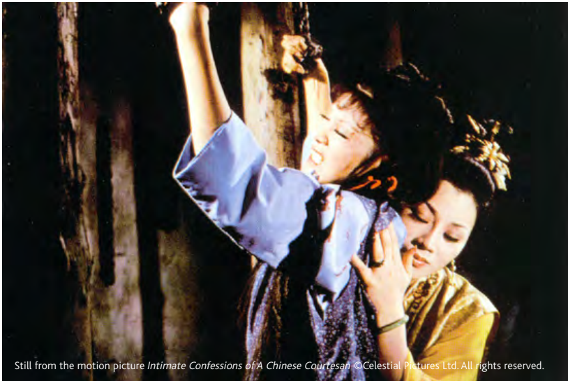
Chor Yuen's Intimate Confessions of a Chinese Courtesan (1972) put erotic sense and violence appropriately to use, creating a new kind of film ideologies.

Still from the motion picture Intimate Confessions of A Chinese Courtesan .