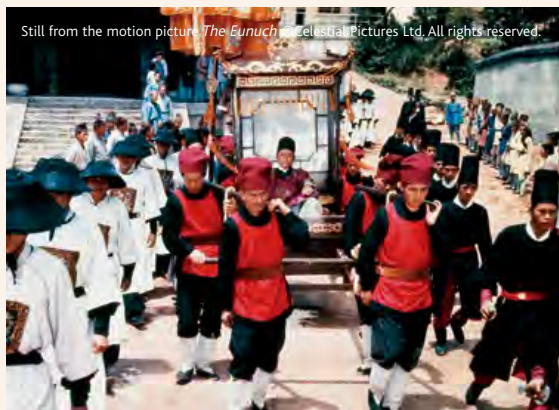
Still from the motion picture The Eunuch