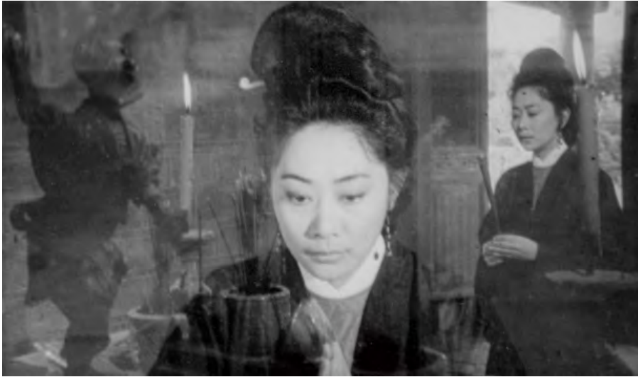
The Arch (1970)