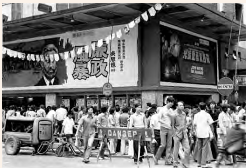
Shot in a documentary style, Anti-Corruption (1975) merged fiction with reality, and was a precursor to other Hong Kong films in this canon. Pictured here is the crowded entrance of Gala Theatre upon release.

of documentaries. Second, we tried to film secretly, with pedestrians inside the shots without them knowing; unlike in Shaw's productions, it was easy to tell that people onscreen were hired as extras. Third, we didn't use any professional actors, and instead we hired amateurs for a better sense of persuasion. I knew that including professional actors would ruin the entire set-up of the film.