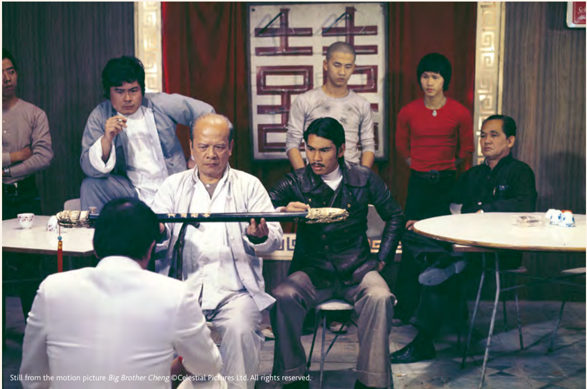
Chan Koon-tai grew a moustache particularly for his character in The Teahouse (1974), which has since become his trademark. The above is a still from Big Brother Cheng (1975), a sequel of The Teahouse .

and shooting style. I was only an actor, but I slowly grew to love this industry while observing how he filmed.