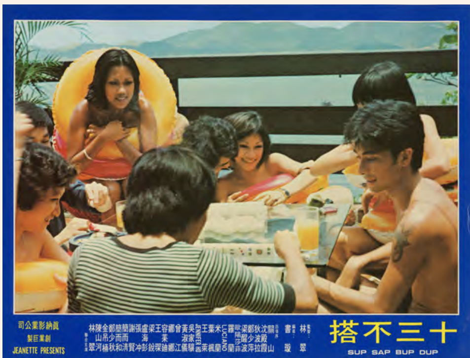
The swimming pool scene in Sup Sap Bup Dup (1975)