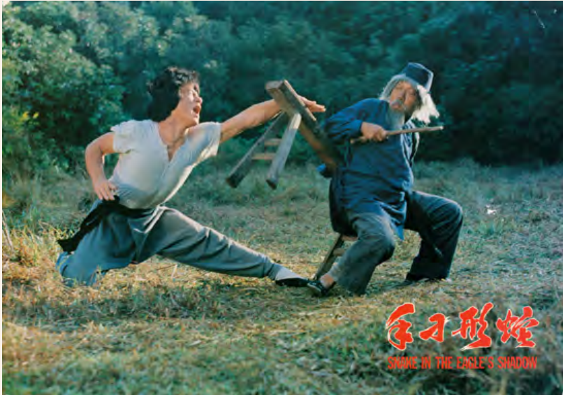
Snake in the Eagle's Shadow (1978) made Jackie Chan a star, and paved the way for him in the Japanese market.

stunt for films, so we worked together on a script and added some comedic elements in. The main character was a young man, so I immediately thought of Jackie Chan for the role. Yuen Woo-ping took me several rounds of persuasion before agreeing to be director of the film. Upon its release, Snake in the Eagle's Shadow was an instant hit, both locally and overseas.