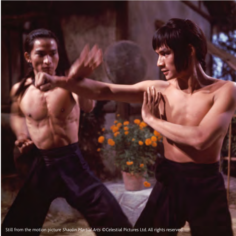
Still from the motion picture Shaolin Martial Arts ©Celestial Pictures Ltd. All rights reserved.

Chang Cheh made a series of Guangdong kung fu hero films set under the Qing dynasty in the 1970s, such as Shaolin Martial Arts (1974). They played a crucial role in reviving 'Southern Shaolin' martial arts traditions.