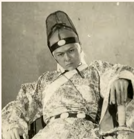
Bai Ying's makeup portrait for Dragon Inn (1968)