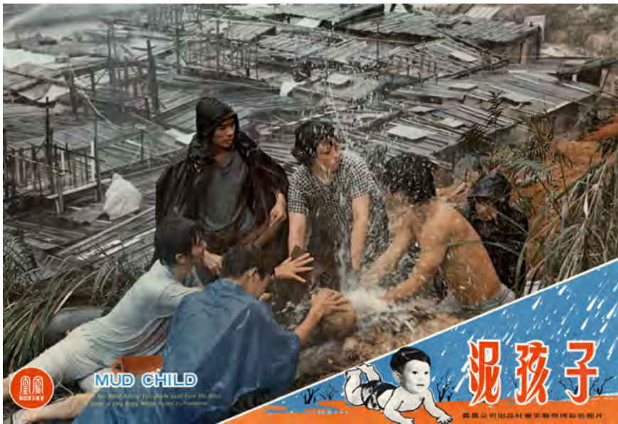
Mud Child (1976) depicts how the government fails to provide disaster relief after a deadly typhoon hits Hong Kong. Meanwhile residents are left to fend for themselves.

film company Chung Yuen also threw its hat in the ring by promoting Mainland Chinese newcomer Jet Li with their ‘authentic’ Shaolin martial arts films. However, it was already 1982 when that happened.