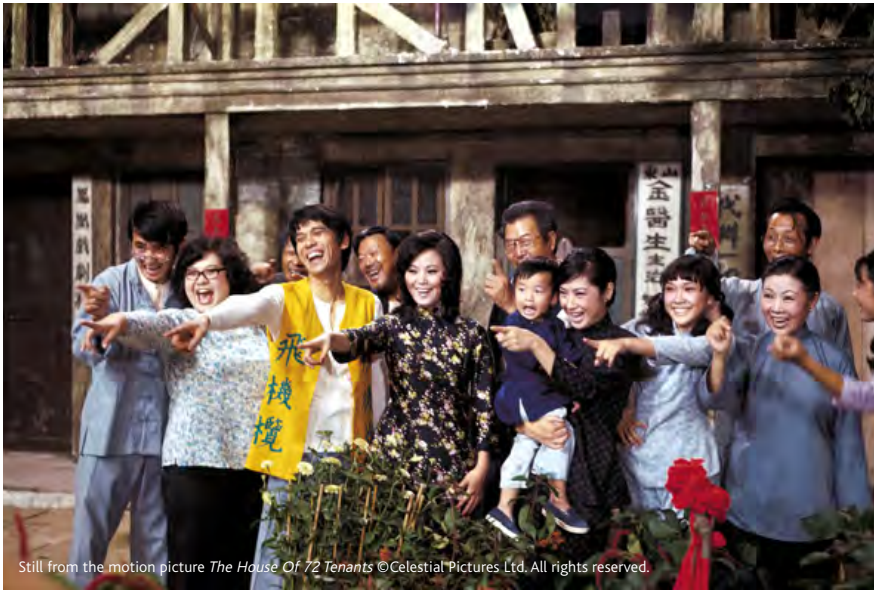
The House of 72 Tenants (1973) reinvigorated Cantonese cinema and made box-office history with its vivid, nifty Cantonese dialogues.

Still from the motion picture The House Of 72 Tenants