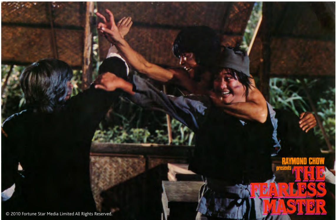
Knockabout (1979), directed by Sammo Hung, combined actions from kung fu films with the Hui brothers' comedy sequences to create a hybrid of action comedies. It is an important early work of the new genre.