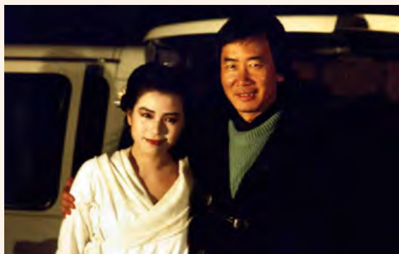
Photographed with the lead actress, Cherie Chung during the shoot of Golden Swallow (1987)