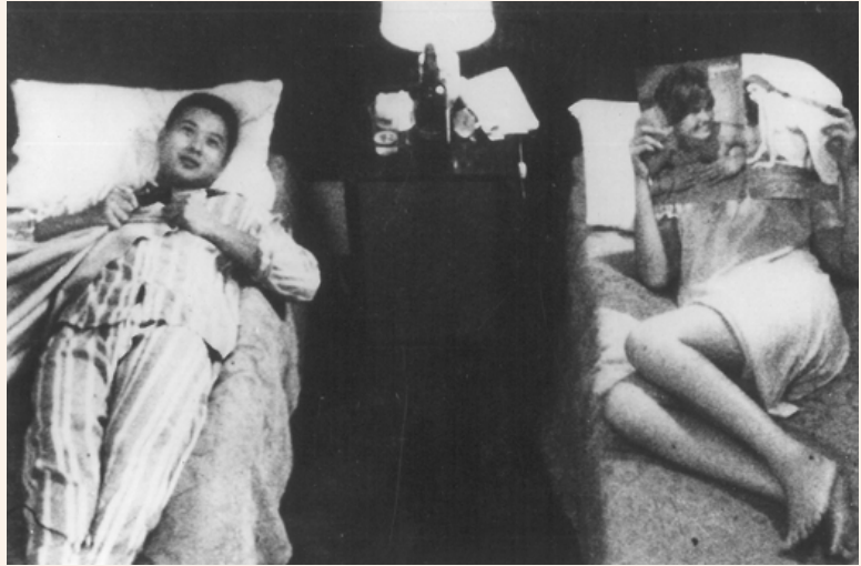
A still from Gulf

signed the both of us at the same time, nurturing us to become actors.