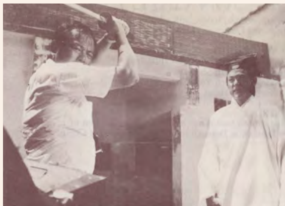
Master King Hu (left) was directing on set.