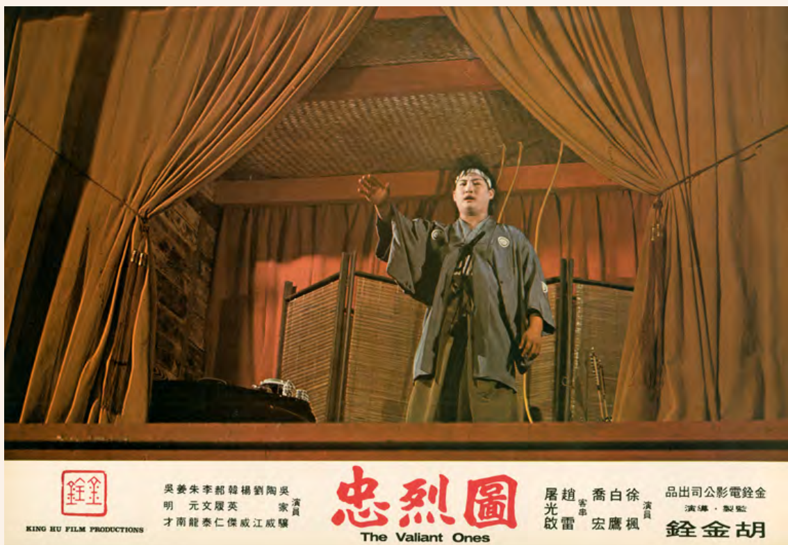
With the stage name Chu Yuen-lung, Sammo Hung served as the martial arts choreographer for The Valiant Ones (1975), directed by King Hu. He also starred as the wokou leader Hakatatsu.