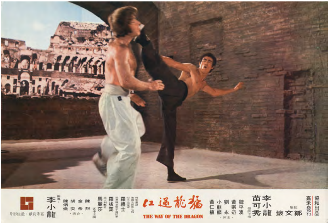
In The Way of the Dragon (1972), Bruce Lee defeated the symbolic white overlord with genuine martial arts skills, which coincided with the global 'anti-imperialist, anti-colonial' thinking at the time.

kung fu. Lee's shattering of the 'Sick Man of East Asia' stereotype forced upon the Chinese by the Japanese was a fist-pumping moment for audiences and appealed to contemporary anti-Japanese sentiments that stemmed from the Diaoyu Islands dispute at the time. In The Way of the Dragon (1972), directed by Lee himself, his character also used his kung fu prowess to defeat Caucasian fighters and malevolent foreign powers. These ideas coincided with the rise of anti-imperialist and anti-colonial thoughts in many parts of the world. Lee spearheaded kung fu films into an era of unprecedented popularity and international recognition as the words 'kung fu' became recognisable all over the world. Bruce Lee was revered as an international superstar and national hero. The rise of wuxia and kung fu films in the 1970s echoed the social atmosphere of post-1967 Hong Kong. Their popularity also reaffirmed wider trends as advocated in the third world, namely ideas to do with anti-Western and colonial influence, anti-economic hegemony, as well as demands for independence and freedom worldwide. Born out of a hotbed of social changes, the kung fu boom brought about many innovations and opportunities for Hong Kong cinema. It also served as an example of how Hong Kongers used the medium of film to construct an identity for themselves amidst social change and development.