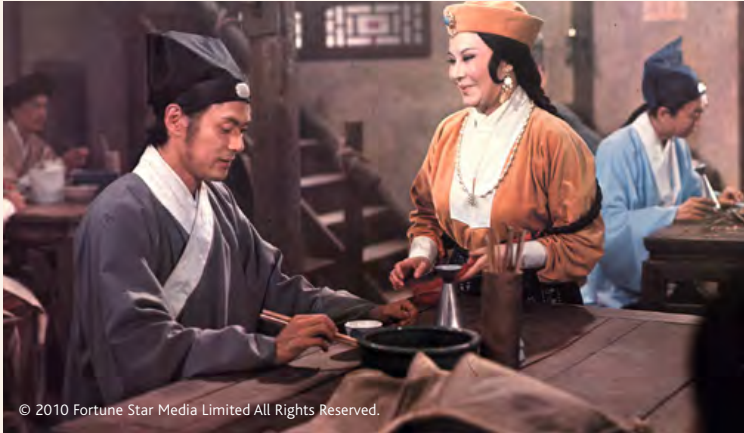
Bai Ying collaborated with Li Lihua in The Fate of Lee Khan (1973).