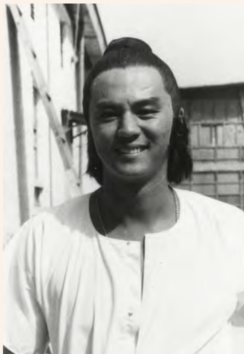
On-set photo of Ti Lung shooting period films

some low, each clearly defined. Editing is the wizard now. If you want to shoot an actor dropping on a tabletop, you cover the table with rubber. The corners are fake, and the crash mats made to resemble metal. The actors are fully protected by stunt pads, some reinforced by metal. The times have changed, and audiences' tastes have evolved. In the past, action choreography required viewers to be 'discriminating', to be able to distinguish Hung Fist from Wing Chun and Thai boxing. But in an era when the tap of a finger can trigger an explosion, viewers are after visual impact rather than realism. They don't need to know if the actors can really deliver their punches. They're happy as long as it's sumptuous and it dazzles.