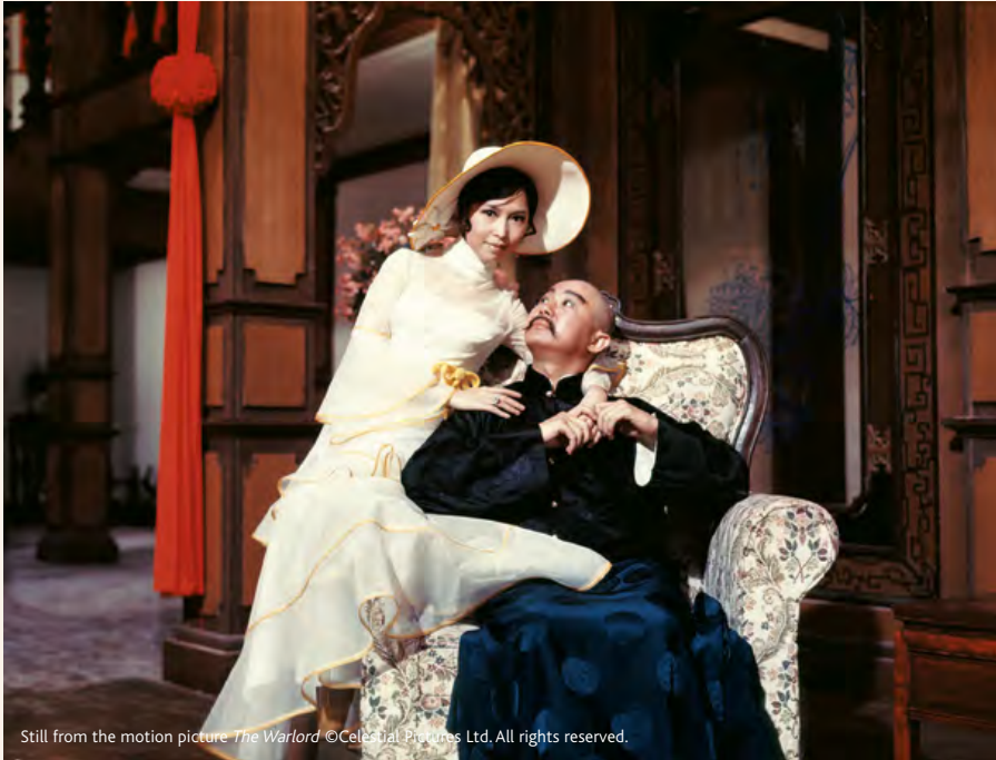
Michael Hui's breakout film, The Warlord (1972) showcased his talents and was crowned the second best-selling production of the year.

Still from the motion picture The Warlord