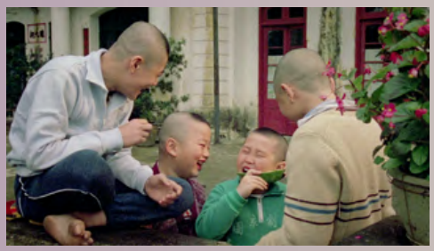
《七小福》(1988):圍在一起吃西瓜,吃到最後再拿起瓜皮抹臉,原來是小孩的即興表演。 Painted Faces (1988): Some boys huddled together eating a piece of watermelon, and when they had finished, they rubbed the watermelon rind over their faces. This scene happened to be an improvisation.

版權由天映娛樂有限公司全部擁有 Licensed by Celestial Pictures Limited. All rights reserved.