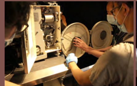
參加者在指導下將菲林放進放映機內 A participant puts a strip of film into the projector under guidance