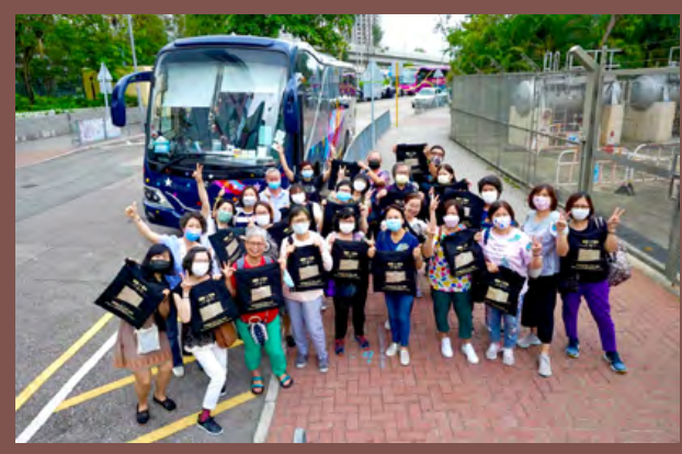
「文化活現之旅」:齊齊往塘西尋找「太平」昔日足跡。 'A Trip Through Time': Let's ride to Tong Sai and re-discover the past of the Tai Ping Theatre.

Driving through the streets, our tour group saw a seemingly endless row of buildings, very much an urban jungle scene common in Hong Kong today. If not for old photos of the site, one would have found it difficult to believe that Bonham Street and its surroundings used to be filled with European-style architecture. Audrey Yip explained that the