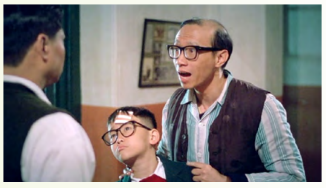
羅啟鋭悄悄把自己放進《七小福》,「四眼龜」(中)的原型就是他。 Alex Law mischievously slipped himself into Painted Faces . The prototype of the character 'Four-eyed Turtle' (middle) is Law himself.