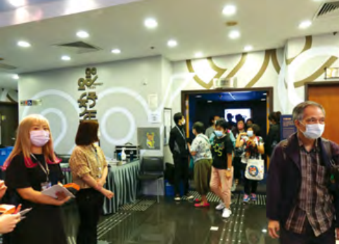
團隊迎來資料館首個開放日 Ready for our first fun day!