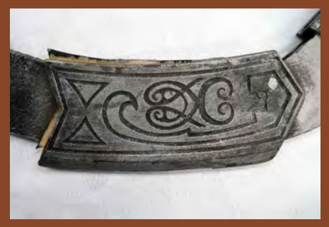
修復前的血滴子道具的受損部分 Damaged part of the flying guillotine prop before conservation treatment