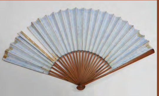
修復前 Before conservation treatment