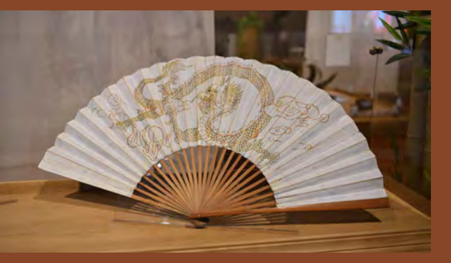
經修復的摺扇 Folding paper fan after conservation treatmant

the structure of the artefacts, and if not stable, we will have to conduct conservation treatment. Also, we need to design the most suitable way to display each artefact, so as to ensure that it can be exhibited in a safe, ideal