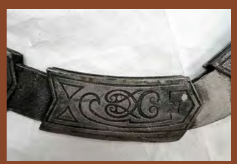
修復後 After conservation treatment