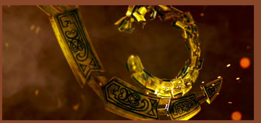
《血滴子》(2012)的一個畫面 A scene from The Guillotines (2012)