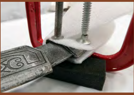
使用夾鉗來固定結構 Using a clamp to stabilise its structure