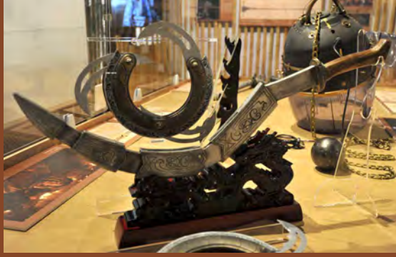
參考電影畫面來展示血滴子道具的兩個組件 We drew reference from the movie when designing the display for the two components of the flying guillotine

After restoring and strengthening the fan's structure, we used some acrylic paint to retouch the surface. We mainly used white paint mixed with small amounts of blue to imitate the original colour, and then painted over the yellowed surface. Thus, the discoloured parts of the fan were restored to their original colour.