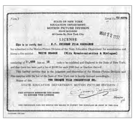
《白金龍》的准映證 The screening license of The White Gold Dragon

根據三百多份對白本整理出來的 故事已隨《香港影片大全第一卷增訂 本》(一九一四至一九四一)的出版 再現,此前謎樣的電影,終能給世界 看見。編製《大全》第二卷增訂本的 工作現已展開,這批寶藏,將再次擔 當重要的歷史角色。