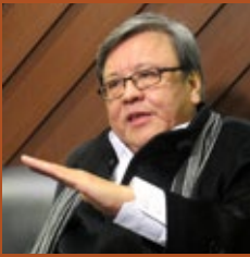
冼杞然（上圖）開拍中產喜劇《三人世界》（1988）（下圖），開畫時票房慘淡，之後瞄準白領觀眾展開宣傳攻勢，終令票房收入急增。

Stephen Shin (top) made the middle-class comedy Heart to Hearts (1988) (bottom), which started off as a box office flop. But after redirecting the publicity to target a white-collar audience, the film grew hugely in popularity.