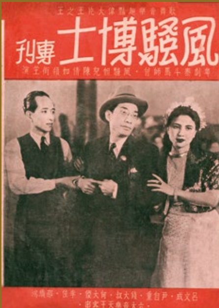
《風騷博士》(1939) The Jolly Doctor (1939)

and we have been fortunate enough to uncover additional visual materials and documents submitted to the authorities for film censorship in the USA. The convenience of the Internet has also allowed us to collate all the new research together with ease, and we have also benefitted from the wisdom and support from many researchers on early Hong Kong cinema in recent years. The stars have thus aligned for the completion of the revised edition of Hong Kong Filmography Volume I (1914-1941) , published eventually in January. 2