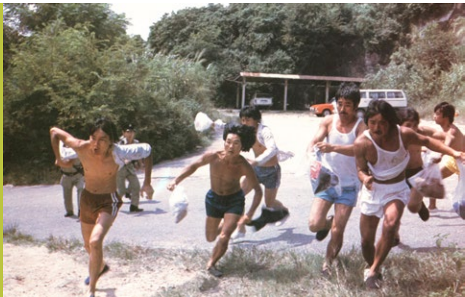
《天堂夢》The Way to Hell (1980)