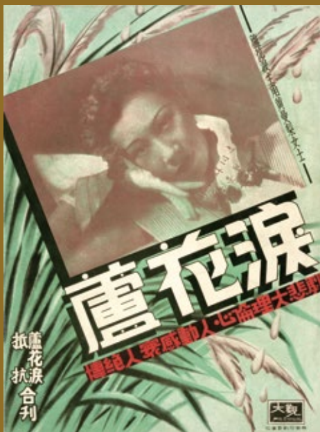
《蘆花淚》(1936) Flowers and Tears (1936)