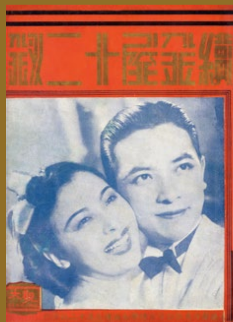
《續金屋十二釵》(1938) Pei-wah's Twelve Wives (1938)

‘Mr Drunken Cat’ may very well be the most amusing landlord to have ever graced the silver screen in the history of Hong Kong cinema. While the landlady of ‘4th Floor, No. 13 Fook Tak Lower Street’ screams and bans her humble-folk tenants from doing anything, the landlord secretly joins in on their lively gatherings and banters with gusto. The tenement renters of Follow Your Dream (1941) all have their own story to tell. Against a backdrop of the Second Sino-Japanese War in the early 1940s, all the characters face the same dilemma: to stay or not to stay? And if not, where should they go? They each make their own choices. The landlord himself comes from a well-to-do family in Guangzhou, and upon returning to his hometown he finds his family business completely devastated. He returns, shell-shocked, to No. 13 Fook Tak Lower Street, muttering ‘No more! Not here anymore!’ incessantly. His wife the landlady, tortured by the wages of war, spits out bitterly, ‘I’ll remember this for the rest of my life!’