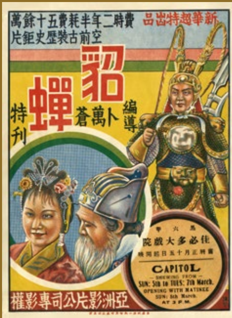
《貂蟬》(1938) Sable Cicada (1938)