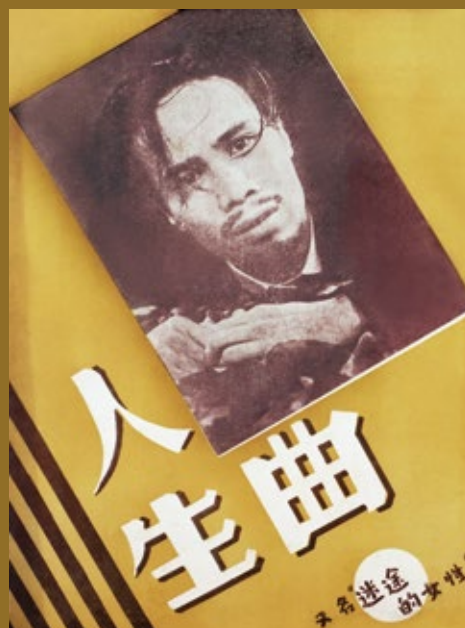
《人生曲》(1937) Song of Life (1937)