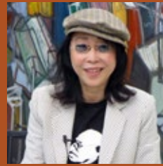
張婉婷（上圖）分享導演《秋天的童話》（1987）（下圖）的點滴。

Stephen Shin (top) made the middle-class comedy Heart to Hearts (1988) (bottom), which started off as a box office flop. But after redirecting the publicity to target a white-collar audience, the film grew hugely in popularity.