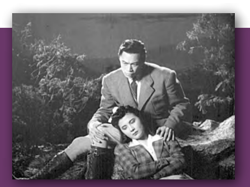
妹妹我愛你 Little sis, I love you