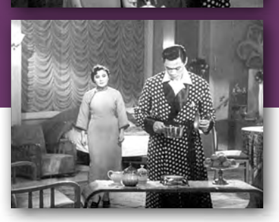
夫:女人打扮是重於一切! 妻:請你吃香粉和香水好了! Husband: Grooming is everything to a woman! Wife: Then serve yourself face powder and perfume for late-night snack!