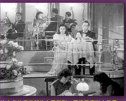
片中名仕俱樂部的衣香鬢影,印證了傳說中昔日 上海的繁華並非空穴來風。 All the glitz and glamour of high society points to the fact that the reputed glory of old Shanghai is not unreal.

by then, is a scarlet beauty mark just over your heart.' 2 The wild dream of having the best of both worlds is nothing unusual: 'one is a spotless wife, the other an amorous mistress', a perfect complement to each other. If in the hands of Nouvelle Vague auteur Jean Eustache, the same story might have become-matterof-factly, if not bluntly-La Maman et la putain (The Mother and the Whore, 1973). But we Chinese are after all more reserved. Typical of the socalled 'Chinese characteristics', our carnal desire is cautiously veiled in a cloak of propriety, all hidden rules duly observed to avoid any probable loss of face.