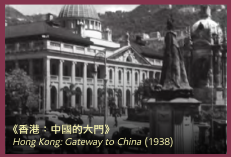
終審法院大樓 The Court of Final Appeal

The first exhibition section brings together some of the earliest Hong Kong documentaries, which echo with the 'Digital Album of Film Production Stills' in the last section: