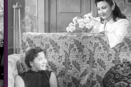
賢妻良母是她,窈窕淑女也是她。 Dutiful wife, doting mother and fair lady all rolled into one.

改變,就算不是專業研究員,也可以在夾縫中找到數之不盡的樂趣。舉個極端的例子:中國文學史首屈一指的愛情經典《西廂記》,原型唐人小說《鶯鶯傳》在二十一世紀讀者眼中,普遍被閱讀為「渣男」始亂終棄悲劇,如何一代傳一代傳經元朝王實甫大刀闊斧修飾成香艷纏綿的版本,箇中曲折就簡直不亞於故事本身,而四十至六十年代上海和香港影壇的多次改編,更折射出不同時代的禁忌,性政治正確與否,完全取決於大氣候。