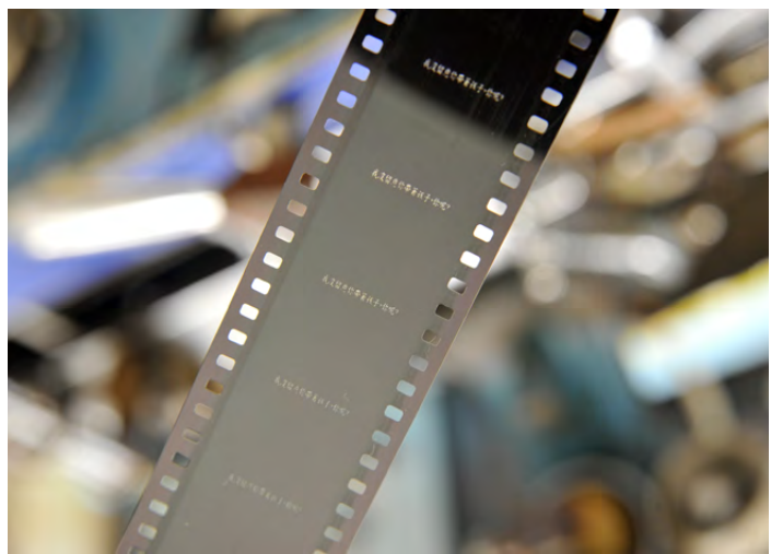
銅版字幕機的製成品 The final product made by the copper-plate printing machine

譯、分句及編號,然後將字幕本送 往植字公司植字,再送往製版公司 製銅版,以及校對銅版製成品、在 菲林上做編號標記等。因此,印製 一個拷貝的字幕動輒便是十多萬格 菲林、數十小時的工夫,而一部電 影往往要製作數個甚至數十個拷貝 供院線放映,背後海量的工夫實在 不足為外人道。