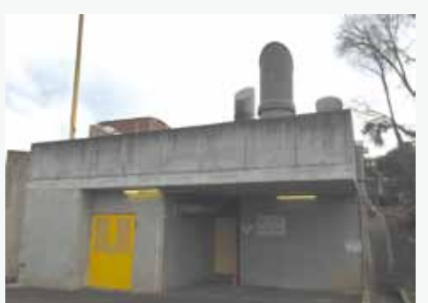
完善的獨立硝酸片片倉 The impressive nitrate film vault