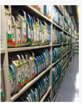
音像資料藏品 Audio-visual collection