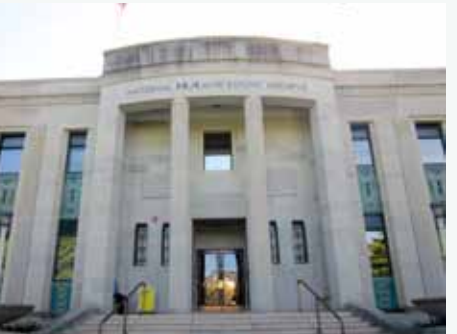
澳洲國家音像資料館 National Film and Sound Archive (NFSA) of Australia

際電影資料館聯盟(國資聯,FIAF)周年大會和東南亞太平洋影音資料館協會(SEAPAVAA)周年大會於今年四月 圓滿舉行。本館兩位代表分別出席這雲集各國電影資料館專才的研討盛會,分享大家所面對的問題與困難。