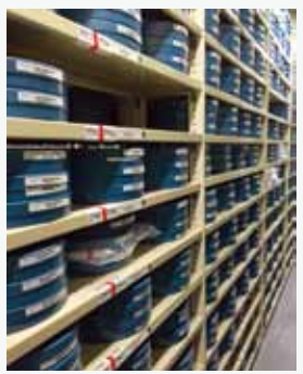
拷貝藏品 Film collection