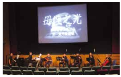
香港知專設計學校傳意設計及數碼媒體學系的師生為黎灼 灼主演的《母性之光》(1933)創作背景音樂及進行現場 伴奏

The instructors and students of Hong Kong Design Institute's Department of Communication Design and Digital Media provided the live music composition and accompaniment for The Sunshine of Mother (1933), starring Lai Cheuk-cheuk.