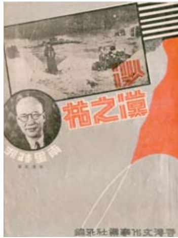
《沙漠之花》特刊封面， 上有編導侯曜相片 The Desert Flower brochure with a photo of the film's writer-director Hou Yao.