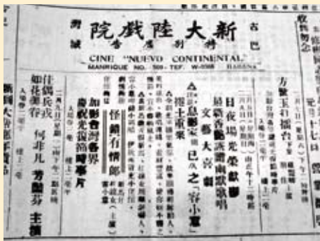
《民聲日報》上的夏灣拿華區電影院廣告 Film adverts of theatres in Havana's Chinatown in Man Sen Yat Po .