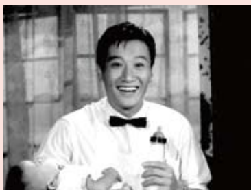
湊仔公「謝賢前世」一新謝賢一貫的風流小生形象 Prince Charming 'Tse Yin's Past Life' reinvents himself as a family man.

為例，片中的謝聖，是個憨實純情的小白領，他「仰視」女神慧玲，而女神竟是老闆金屋藏嬌的黑市夫人，讓人想起《賣油郎獨佔花魁》的賣油小廝秦鐘和臨安名妓美娘；老闆周大班（姜中平飾）和惡妻陳美娥（上官筠慧飾）的那一對，不就活脫脫是《獅吼記》裡的陳季常與柳氏嗎？從兩性關係來看，戲曲裡常見男弱女強——落泊書生配千金小姐、負心漢配貞節婦、弱男配烈女，《追妻記》也一樣，一個是千帆過盡的風塵女子，一個是涉世未深的大男孩。片中的謝聖是典型的現代都市小男人，性感尤物無福消受，醜婦又不對胃口，叛逆飛女駕馭不了，兒女成群又怕怕，「嘉玲二世」秀外慧中，是組織核心小家庭的理想對象，但當他發現夢中情人竟是個被豢養的「小三」，卻又接受不了。倒是女方一步一步從