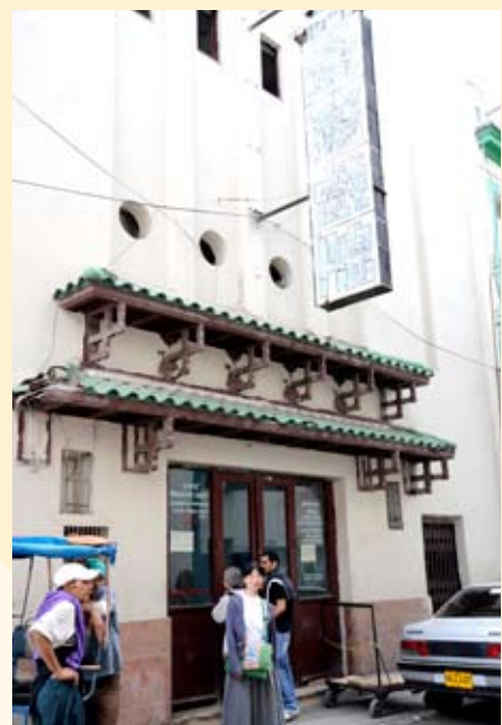
訪尋金鷹戲院。攝於作者與家人2010年古巴之旅, 前為黃愛玲。 Photo taken during the writer's family trip to Cuba in 2010. In front of Cine Aguila de Oro is Wong Ain-ling.