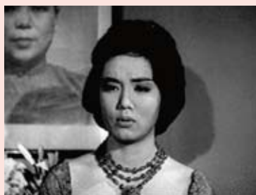
「嘉玲二世」反敗為勝，女人不再需要堅守貞操的道德堡壘也能謀得幸福。 The underdog 'Kar Ling II' triumphs over her odds and takes fate in her own hands.

被動到主動，片末的一席話，更說得漂亮得體，扭轉了形勢，反敗為勝；女人不再需要堅守貞操的道德堡壘也能謀得幸福。片末，正當我們以為一切已成定局的時候，編導又來一個顛倒乾坤——已為人妻人母的慧玲請了以前的傭人回來，因為她不甘於留在家裡做家庭主婦，要重投社會，回到……回到舊情人那裡去當他的秘書。小丈夫酸溜溜地說：我又要追過？可會是另一場危機的開始？