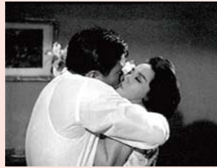
假鳳虛凰戲假情深，「前世」得咗！ More than just drama: the reel-to-real couple seal their love with a kiss.

談起秦劍的輕喜劇，一般都會想起《難兄難弟》（1960）而忘記了《追妻記》（1961）。事實上，七十年代開始之後的香港電影，寫江湖上稱兄道弟的多，拍現代都市男歡女愛的少。六十年代的粵語電影倒曾出現過一批以現代男女為題材的都市輕喜劇，光藝和新藝的秦劍、嶺光的莫康時等都拍過不少這種類型，《追妻記》編導演俱佳，可說是其中最出色之作。