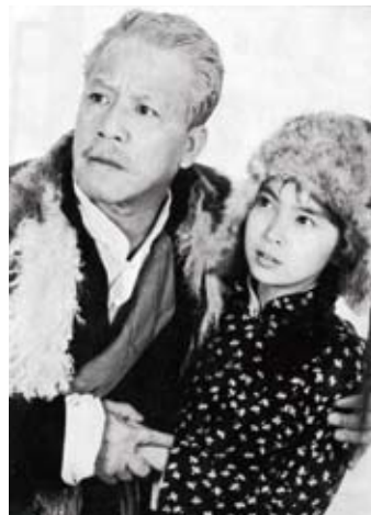
王引（左）、蕭芳芳師徒相濡以沫 Wang Yin (left) and his protégée Josephine Siao toil through thick and thin.