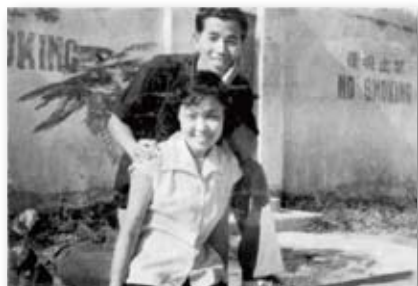
我（倆）在友僑 Days at the Youqiao Film Studios