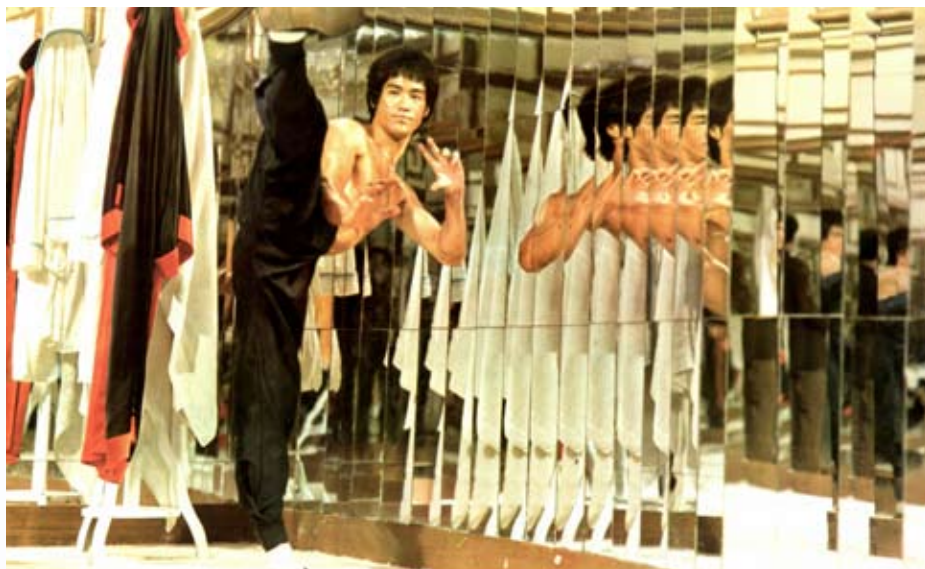
「奇謀闊步·萬像嘉禾」開本館以DCP放映機放映電影之先，影展自3月22日至6月30日舉行，同期舉行展覽及出版專題書籍。 'The Cinematic Matrix of Golden Harvest' marks the start of DCP screenings at the HKFA. The programme runs from 22 March to 30 June, including an exhibition and book release.

The world, whether you like it or not, is undergoing a paradigm shift towards the age of the digital. Since a decade ago, archivists, scholars and film professionals, be it mournfully or willingly, have prophesied that celluloid would be totally replaced by digital in the long run and the rapid technological developments have all pointed towards the 'death of the celluloid'.