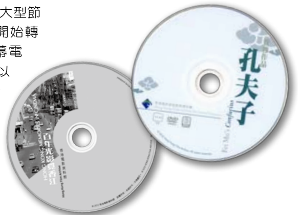
本館去年推出的兩張數碼影音光碟 The two laserdiscs released by the HKFA in 2012.

儘管「數碼當前」，但必須強調，我們對於數碼轉移所引起的專業操守和文化問題，以及更多未來不得不面對的挑戰，並沒有掉以輕心。我們是承傳120年的菲林文化 (當然也是所有其他過去的影音格式) 孕育出