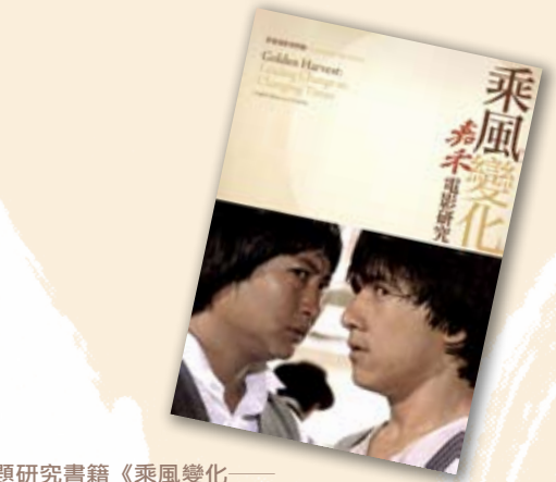
專題研究書籍《乘風變化——嘉禾電影研究》將於三月下旬出版 Golden Harvest: Leading Change in Changing Times will be published by the end of March.