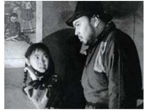
修復前後 Before and after restoration

修復《苦兒流浪記》根據現存的16毫米拷貝進行，意大利L'Immagine Ritrovata電影修復工作室為該片作2K解像度掃描及電腦數碼修復，大幅度減少畫面擺動、刮痕、斑點及背景噪音等，並重現部分已溶解的畫面，最後數碼輸出2K解像度檔案及35毫米拷貝供保存及放映。