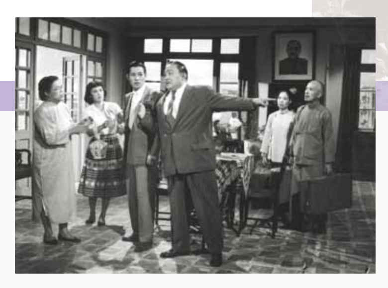
《野花香》(1959): 干戈逐子 Wild Flowers are Sweeter (1959): a fuming father kicks his son out of their home

路,突顯他所受由尊至卑的屈辱,尊 嚴盡喪,這跟原著小說中的教授也完 全是另一回事,而又皆有深邃的人性 刻劃。小說中教授其實是個有仇必報 的陰險之徒,他後來走的是另一條墮 落的路——經營烏煙瘴氣的俱樂部。 不過,《垃圾教授》和《藍天使》中火 遮眼的教授捏著歌女頸項只是差點要 了她的命,不似東渡來港後的激烈版 本,連環死人。