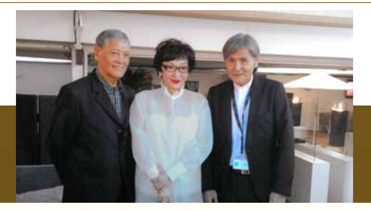
今年五月《俠女》修復版亮相康城,(左起)石雋、 徐楓、白鷹喜相逢 The restored version of A Touch of Zen was screened at the Cannes Film Festival this past May. (From left) Shih Chun, Hsu Feng and Bai Ying

authentic atmosphere for The Venturer (1976), which takes place during the Kuomintang's Northern Expedition. We filmed in a place in Tainan called the 'Moon World', as it was like being on the moon—there was nothing there, not even a blade of grass, and it was boiling hot. The film was very atmospheric and effective.