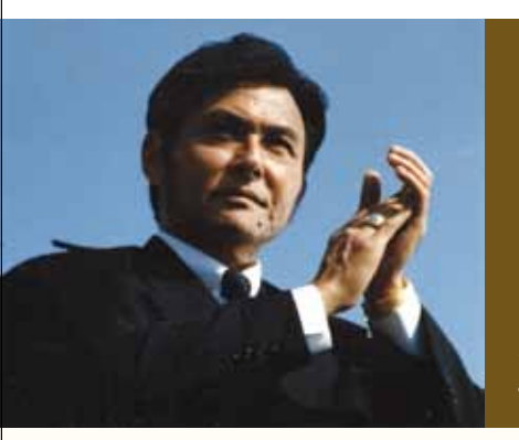
《紅場飛龍》(1990):忍者高手 The Dragon from Russia (1990): a master of Japanese martial arts