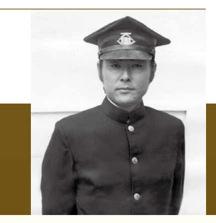
《香火》(1979): 異鄉人捨身為國 Gone with Honor (1979): sacrificing for the home country

要這樣,大家是朋友。後來他跟我商 量:「我的電影學校有很多演員,可 是不會電影動作,你能不能幫忙訓練 一下?」我就答應了。申相玉很感謝 我,又說:「你幫我拍部電影,當個 殺手。」我說「好」,就幫他拍了,他 還規定我「你的動作你自己設計」,我 說「好,沒問題」。