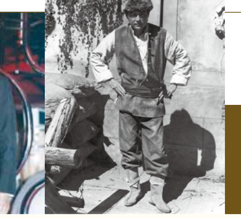
《狼牙口》(1976):勇猛無匹的志士 The Venturer (1976): a courageous hero